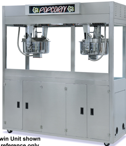
General Twin Unit shown for image reference only.